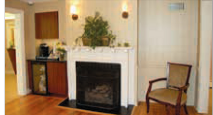
Relax, have a cup of coffee in our newly renovated waiting room!

WE FILE ALL INSURANCE CLAIMS! Our staff works closely with you to optimize your insurance benefits while staying within your financial budget.