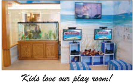
Kids love our play room!